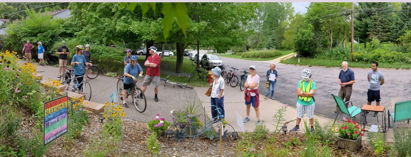
Neighbors gathering to check out a pollinator garden installation in a residential garden.

Progress toward healthy pollinators requires the participation of different individuals and organizations in Minnesota, in addition to well-coordinated efforts by state agencies. IPPT member agencies have ongoing initiatives with external partners that expand agencies' capacity. However, there is still room for building intentional relationships with organizations that are not yet involved in pollinator protection, which can influence their communities toward action.