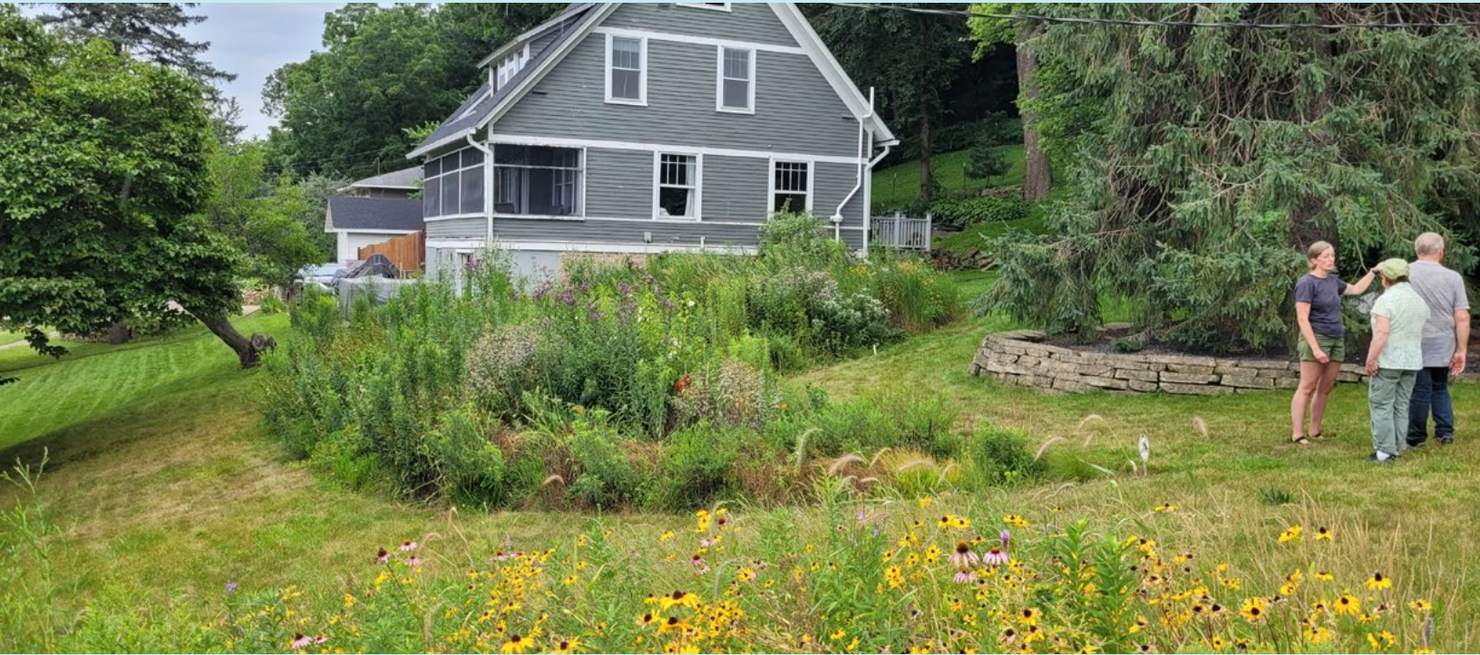
A Lawns to Legumes program grant recipient describes her pollinator meadow and rain garden to Lawns to Legumes Demonstration Neighborhood tour attendees.