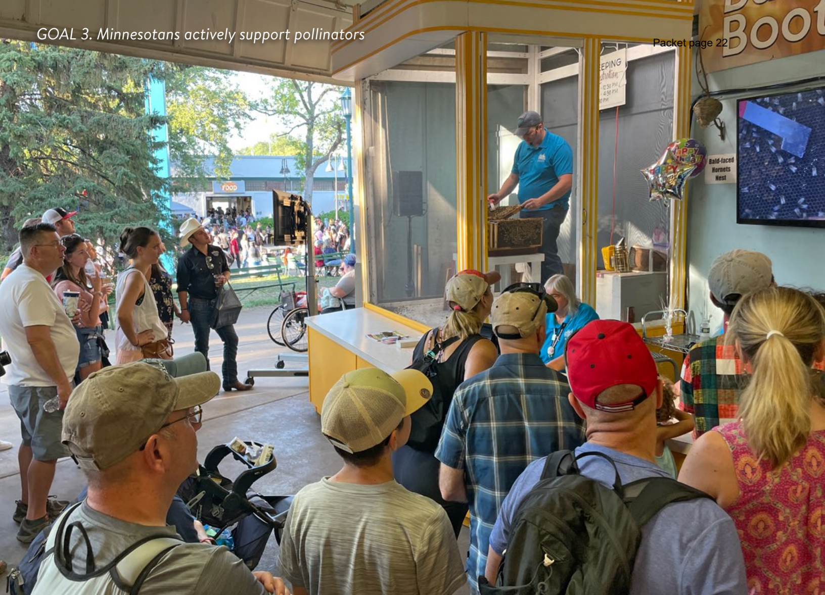
The beekeeping exhibition at the 2022 Minnesota State Fair sparked the interest of the public.