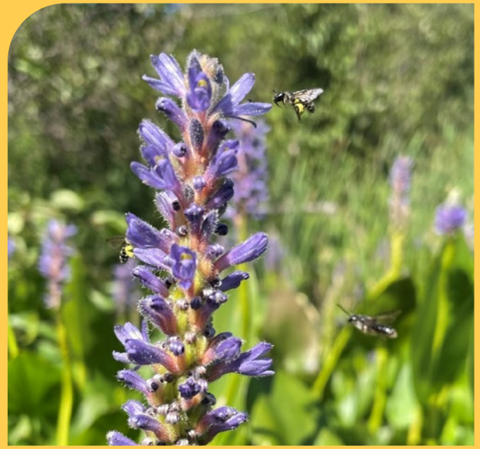
Dufourea novaeangliae bees found during 2022 direct surveys. This species hadn't been recorded in Minnesota since 1934!

The DNR's Minnesota Biological Survey, in collaboration with the University of Minnesota Bee Lab, have documented upwards of 490 species of bees in the state. In 2022, the survey team wrapped up the final year of the wild bee survey, recording bees from the Laurentian Mixed Forest area with a focus on Koochiching County. In addition, researchers began monitoring species of potential conservation concern, in particular those that have specific floral hosts. The results from these monitoring efforts help us understand which bee species are present in Minnesota.