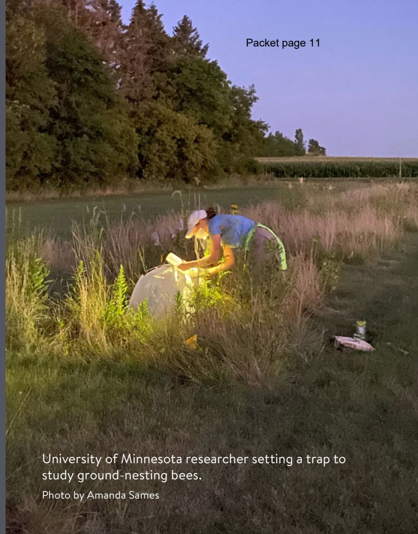
University of Minnesota researcher setting a trap to study ground-nesting bees.

The IPPT consists of staff from the Departments of Administration, Agriculture, Corrections, Education, Health, Natural Resources (DNR), Transportation (MnDOT), the Board of Water and Soil Resources (BWSR), the Minnesota Pollution Control Agency, and the Minnesota Zoological Garden (Minnesota Zoo).