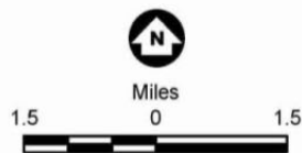
ASSESSMENT ZONES Hollydale Project