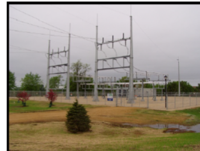
Figure 1 Typical 115 kV distribution substation

Local/State Permitting: -----1 st Quarter 2012 Footings/Foundations: -----Spring 2012 Transmission Line Construction-----Late Summer / Fall 2012 Project Completion -----November 2012