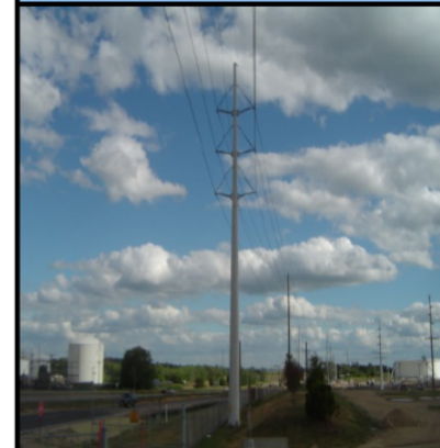
Figure 2 Typical 115 kV structure

For project updates and information, visit greatriverenergy.com/northport or contact: