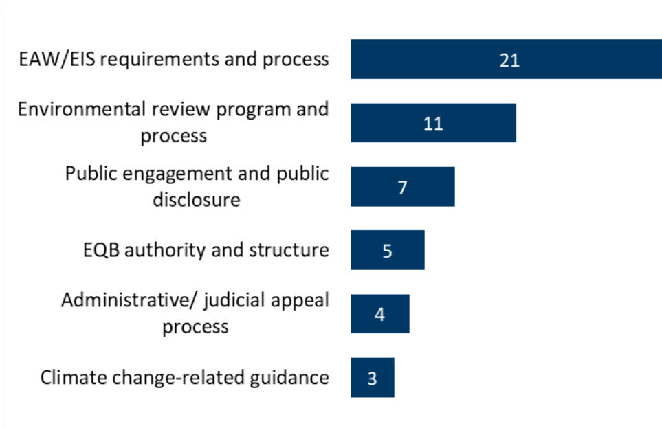
Figure 1. Broad themes of recommendations from past EQB evaluations (N=51)