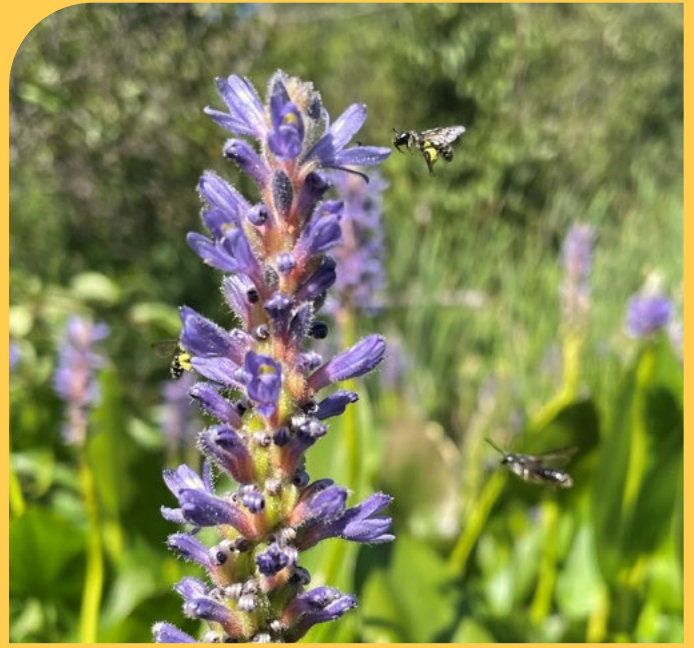
Dufourea novaeangliae bees found during 2022 direct surveys. This species hadn't been recorded in Minnesota since 1934!

The DNR's Minnesota Biological Survey, in collaboration with the University of Minnesota Bee Lab, have documented upwards of 490 species of bees in the state. In 2022, the survey team wrapped up the final year of the wild bee survey, recording bees from the Laurentian Mixed Forest area with a focus on Koochiching County. In addition, researchers began monitoring species of potential conservation concern, in particular those that have specific floral hosts. The results from these monitoring efforts help us understand which bee species are present in Minnesota.