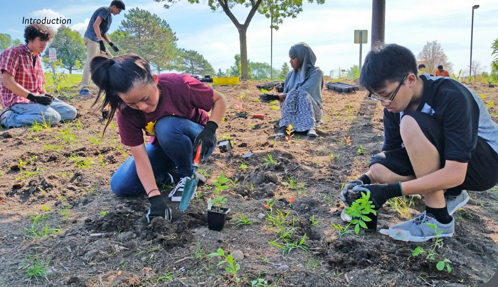
Planting pollinator gardens can foster community collaboration.