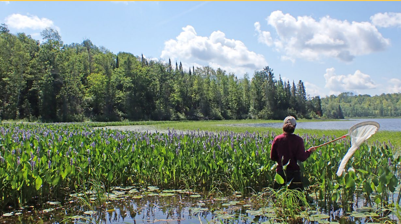
Surveying for bees in Savanna Portage State Park.