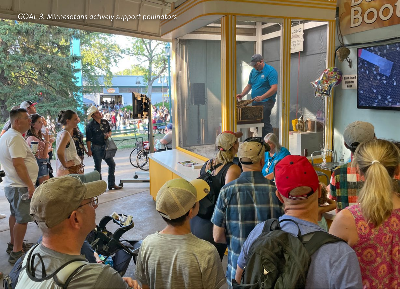
The beekeeping exhibition at the 2022 Minnesota State Fair sparked the interest of the public.