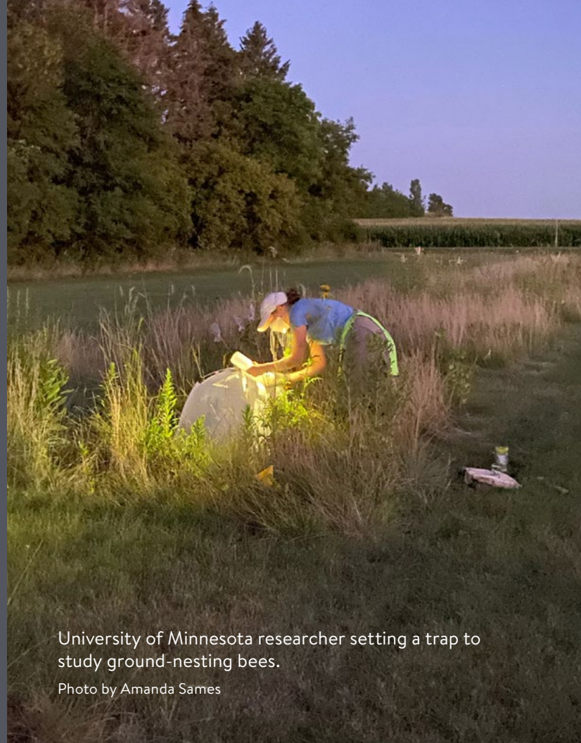
University of Minnesota researcher setting a trap to study ground-nesting bees.

Our interagency team consists of staff from the Departments of Administration, Agriculture, Corrections, Education, Health, Natural Resources (DNR), Transportation (MnDOT), the Board of Water and Soil Resources (BWSR), the Minnesota Pollution Control Agency, and the Minnesota Zoological Garden (Minnesota Zoo).