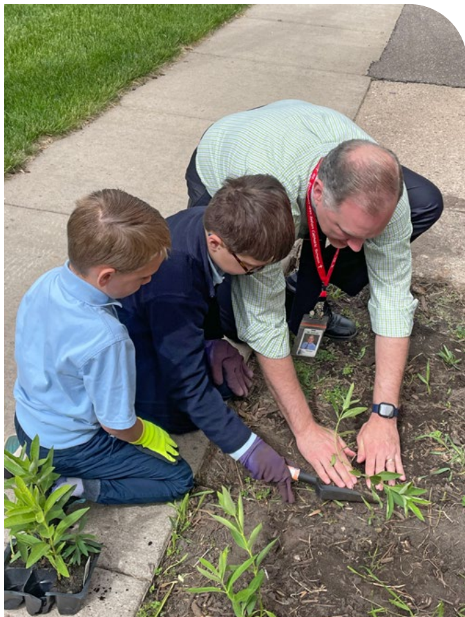
School children learning to plant pollinator-friendly native plants.