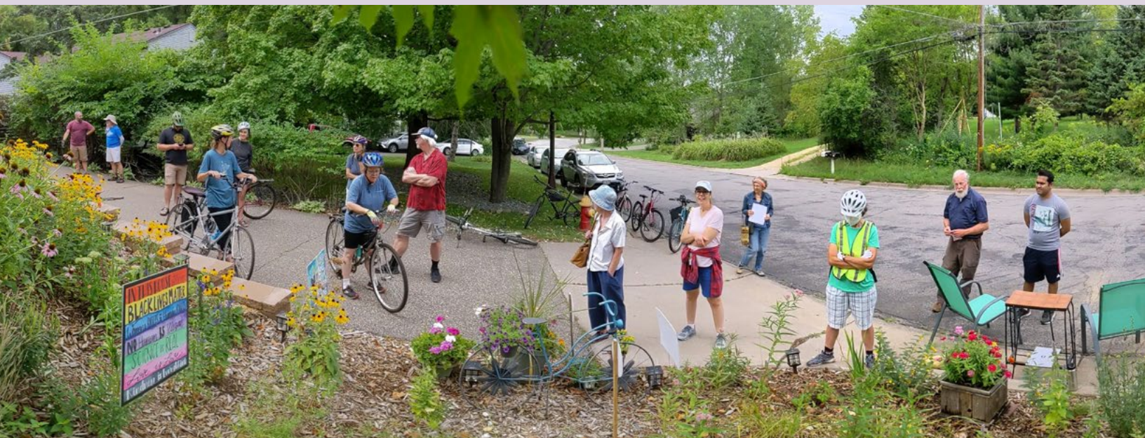
Neighbors gathering to check out a pollinator garden installation in a residential garden.

Progress toward healthy pollinators requires the participation of different individuals and organizations in Minnesota, in addition to well-coordinated efforts by state agencies. There are many ongoing initiatives with external partners that expand agencies' capacity. However, there is still room for building intentional relationships with organizations that are not yet involved in pollinator protection, which can influence their communities toward action.