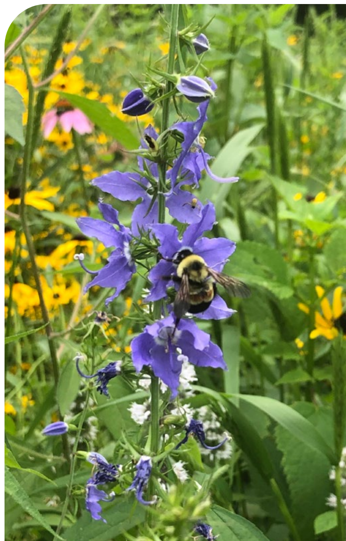
A rusty patched bumble bee, Minnesota’s state bee, forages on American bellflowers in a pollinator planting that is part of the Pleasant Valley Pollinator Corridor, an Lawns to Legumes Demonstration Neighborhood in Winona, Minnesota.

Many organizations conduct research to understand different aspects about pollinators and their needs, such as habitat requirements for different pollinator species, honey bee health and foraging preferences, and effects of pesticides on pollinator behavior and reproduction. State agencies and external organizations have conducted monitoring efforts to learn what pollinator species are present in the state.