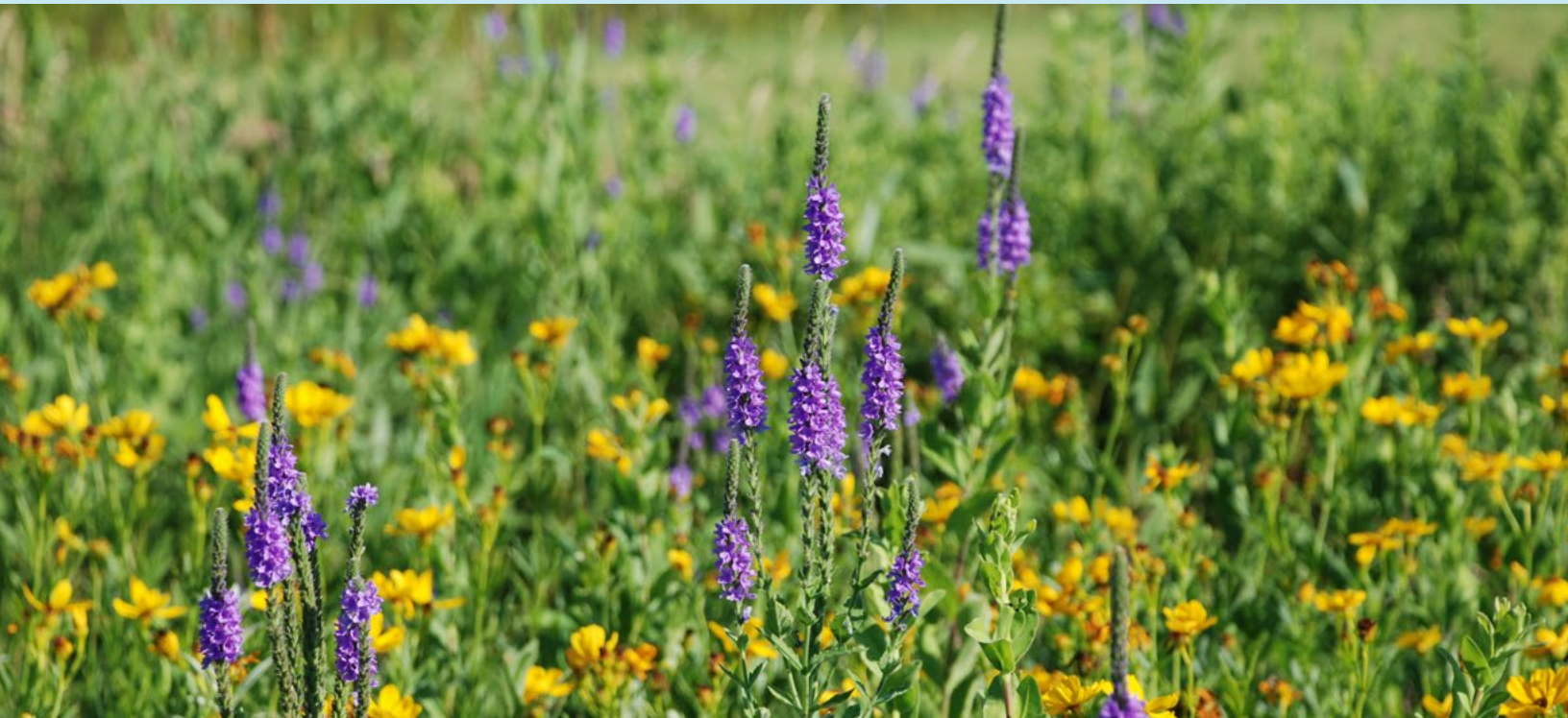
Diverse prairie flowers provide high quality food resources to pollinators.

Habitats are shifting rapidly due to the changing climate. In North America, some plant species are moving toward northern regions and higher elevations. This can reduce the availability and diversity of food resources for pollinators. Additionally, warmer temperatures can cause a mismatch between when pollinators emerge in the spring and when flowers bloom.