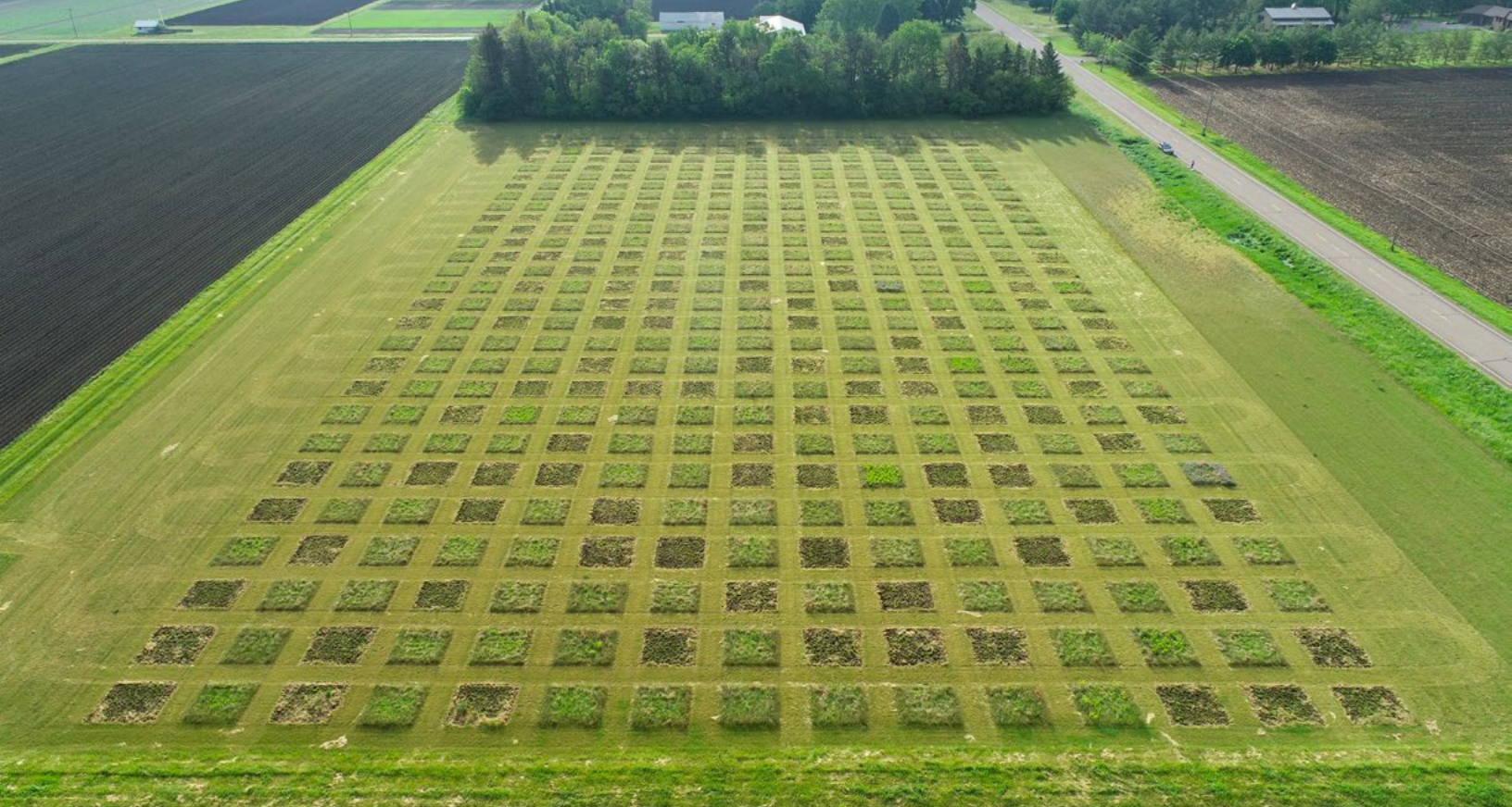
Aerial photo of experimental seed mix plots at the University of Minnesota.

and develop relevant programs to protect them. There is still a long way to address the large knowledge gaps on pollinators, thus we must seek stable funding to generate the information we need to respond effectively to pollinator needs.