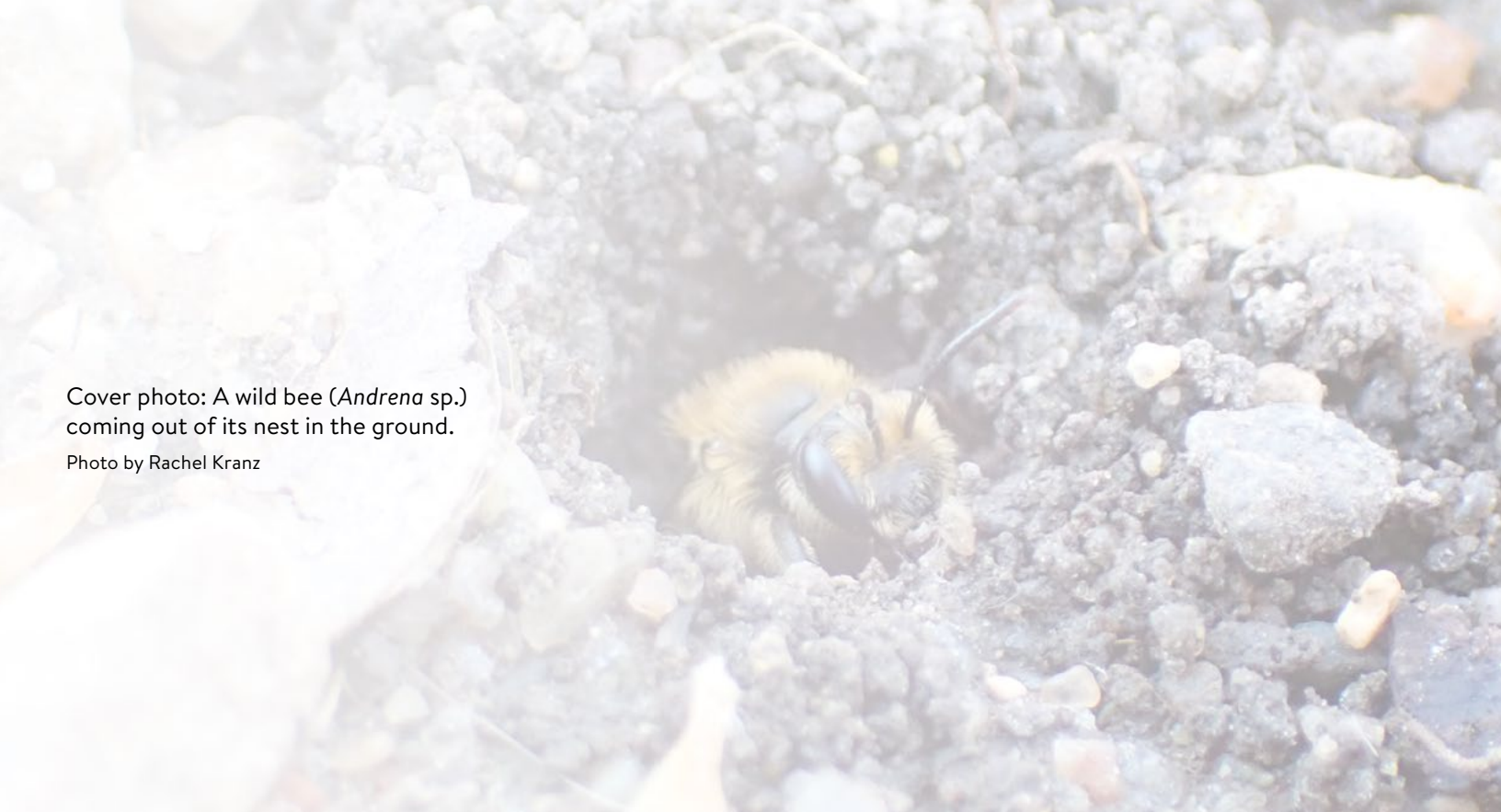
Cover photo: A wild bee ( Andrena sp.) coming out of its nest in the ground.