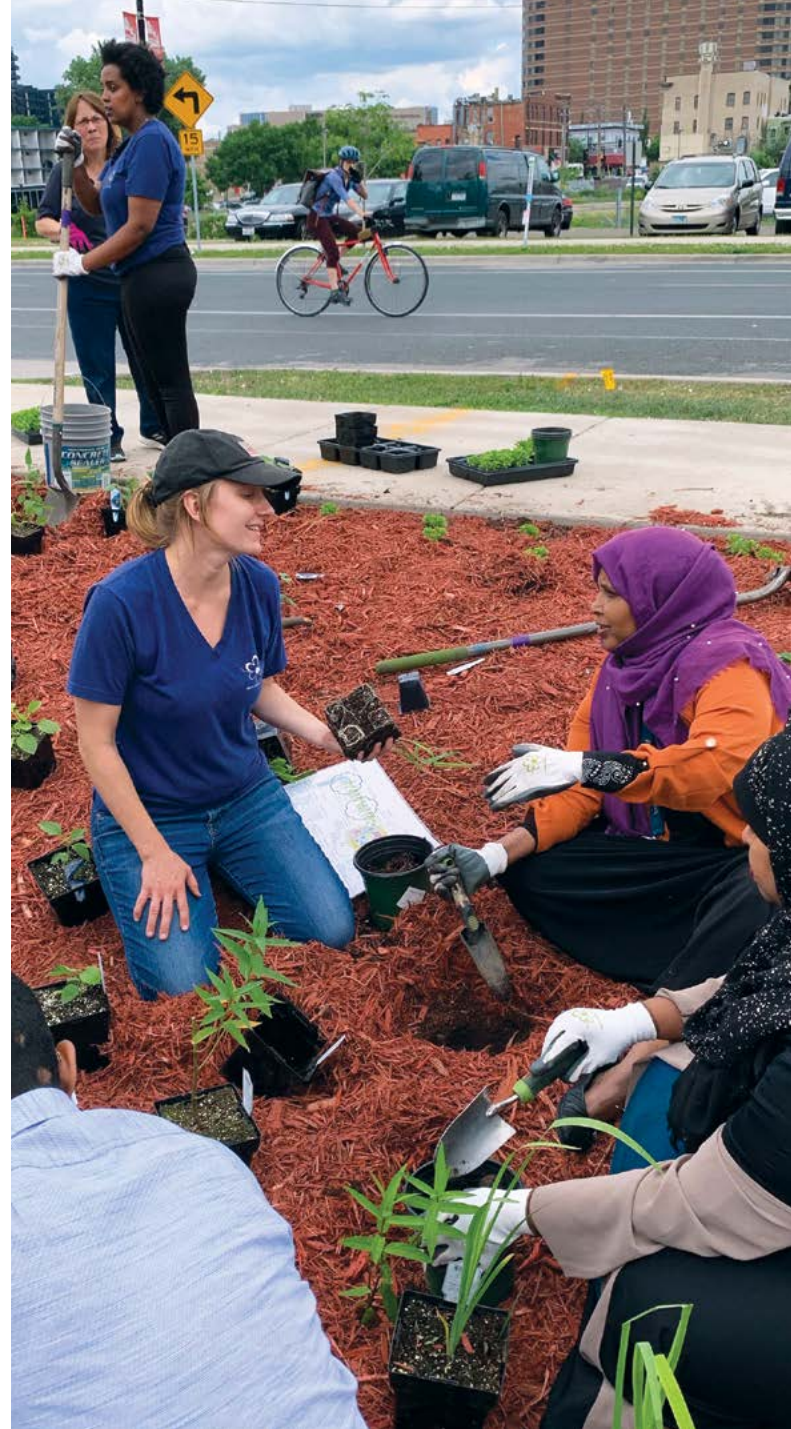
Pollinator-friendly plants can be incorporated into rain gardens that filter stormwater.

To find sources for data and more information about state agency pollinator efforts, visit www.eqb.state.mn.us/pollinators .