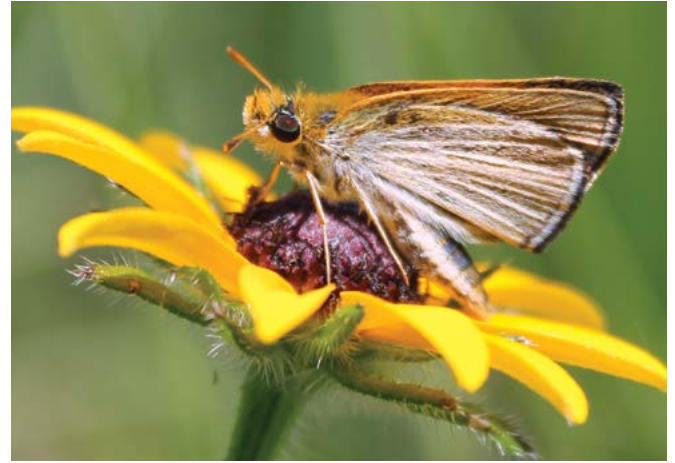
Endangered Poweshiek skipperling butterfly reared by the Minnesota Zoo.