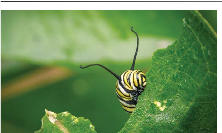
A monarch caterpillar eating milkweed leaves.