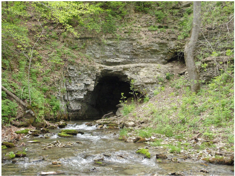
Stagecoach Spring by Watson Creek in Fillmore County